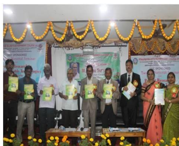
DELEGATES RELEASING SOUVENIR OF THE SEMINAR