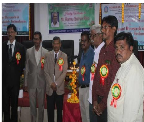
LIGHTENING OF THE LAMP

15 projects and 10 poster presentations were given by students and prizes were distributed